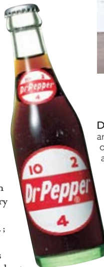
Drink me There are 200 varieties of vintage pop at Soda Gallery.

The Scene: A steady migration of artists, restaurateurs, and boutique owners from Los Angeles and New York has helped transform Dallas's Bishop Arts District from gritty to glam in recent years, but don't expect big hair and big bling: The vibe is hipster chic, with restored 1920s buildings, old-fashioned streetlamps, and blue-and-white-tiled street signs forming a winsome backdrop.