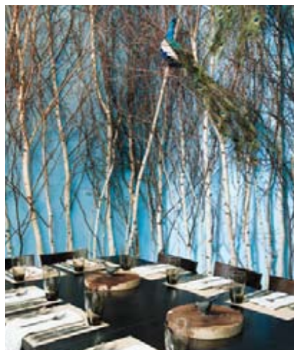
Happy endings Save room for dessert at Tillman's Roadhouse.