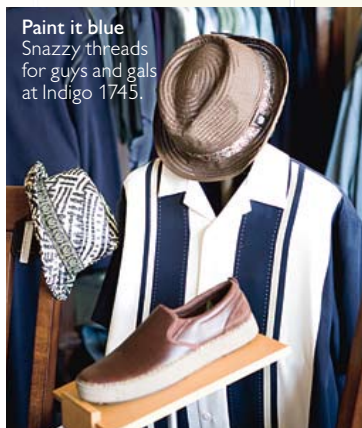
Paint it blue Snazzy threads for guys and gals at Indigo 1745.