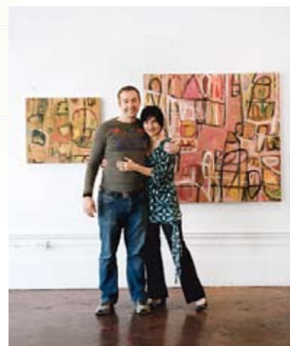
Have an art Decorazon Gallery promotes local artists.