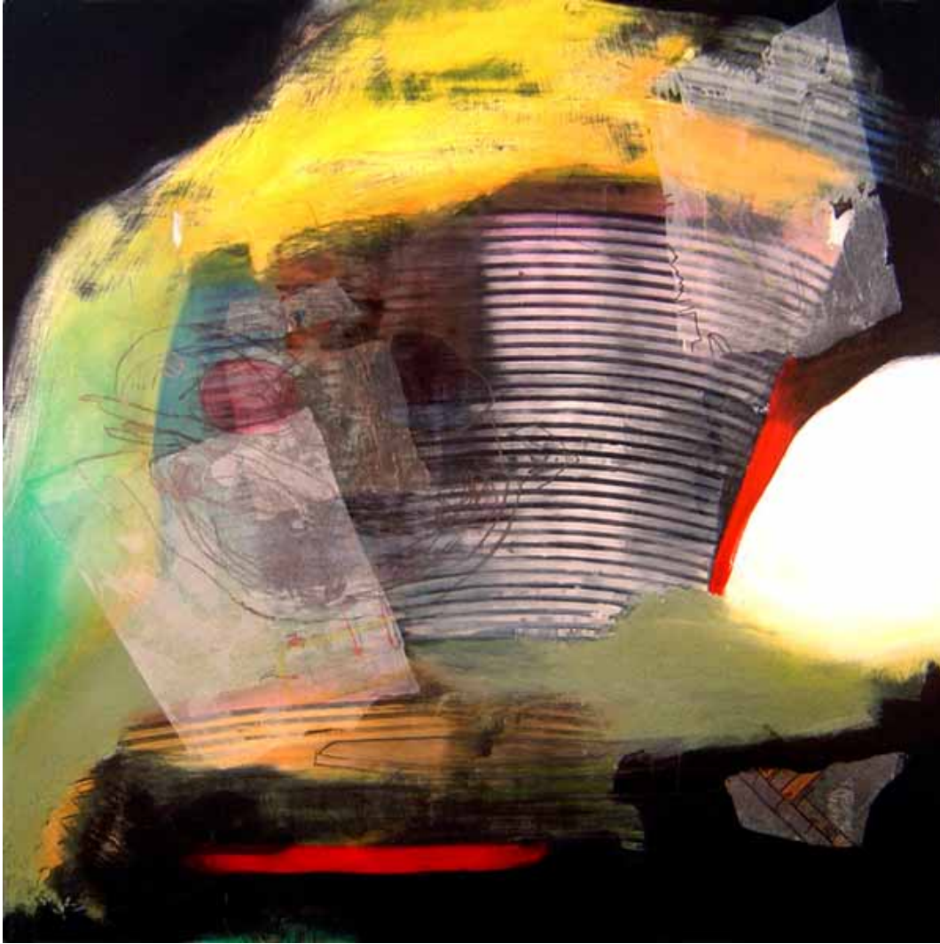
Cara con Rayas 2007 – Mixed media on board – 36x36 inches Lugares y Espacios – 2007 series

DECORAZON gallery, design culture innovation