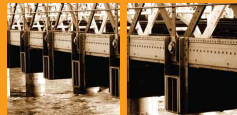
1-6 - Bridge Details - Custom print on birch wood - 2009 - 24x24in. / 61x61cm. - edition of 10