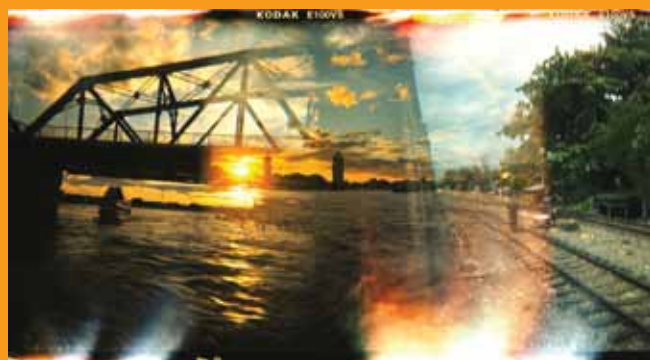
"Bridging Thailand I" - C-print shot on Holga camera - 2008 - 27x50in. / 67x127cm. - edition of 10