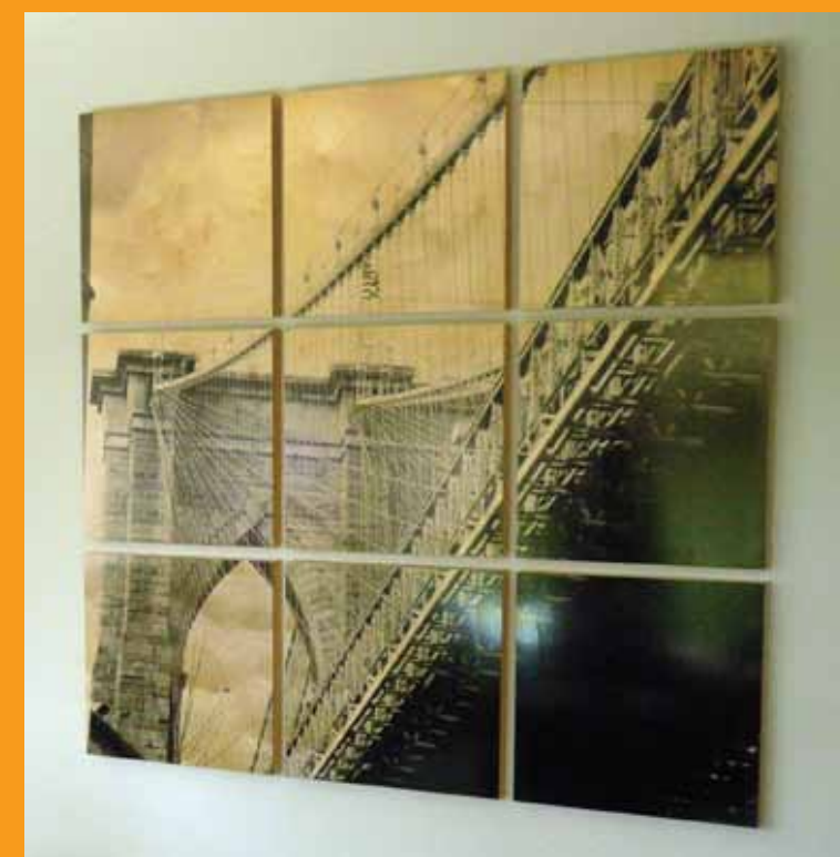
Brooklyn Bridge I - Custom print on birch wood - 2008 - 63x63in. / 160x160cm. - edition of 25