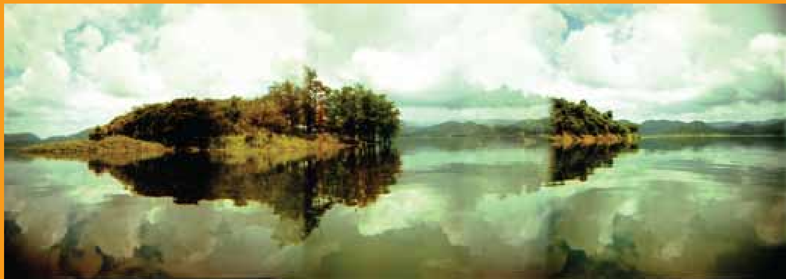
"Fifi Clouds" - Custom print on vintage truck windshield, backlit - 2009 - 14x55in. / 36x140cm.