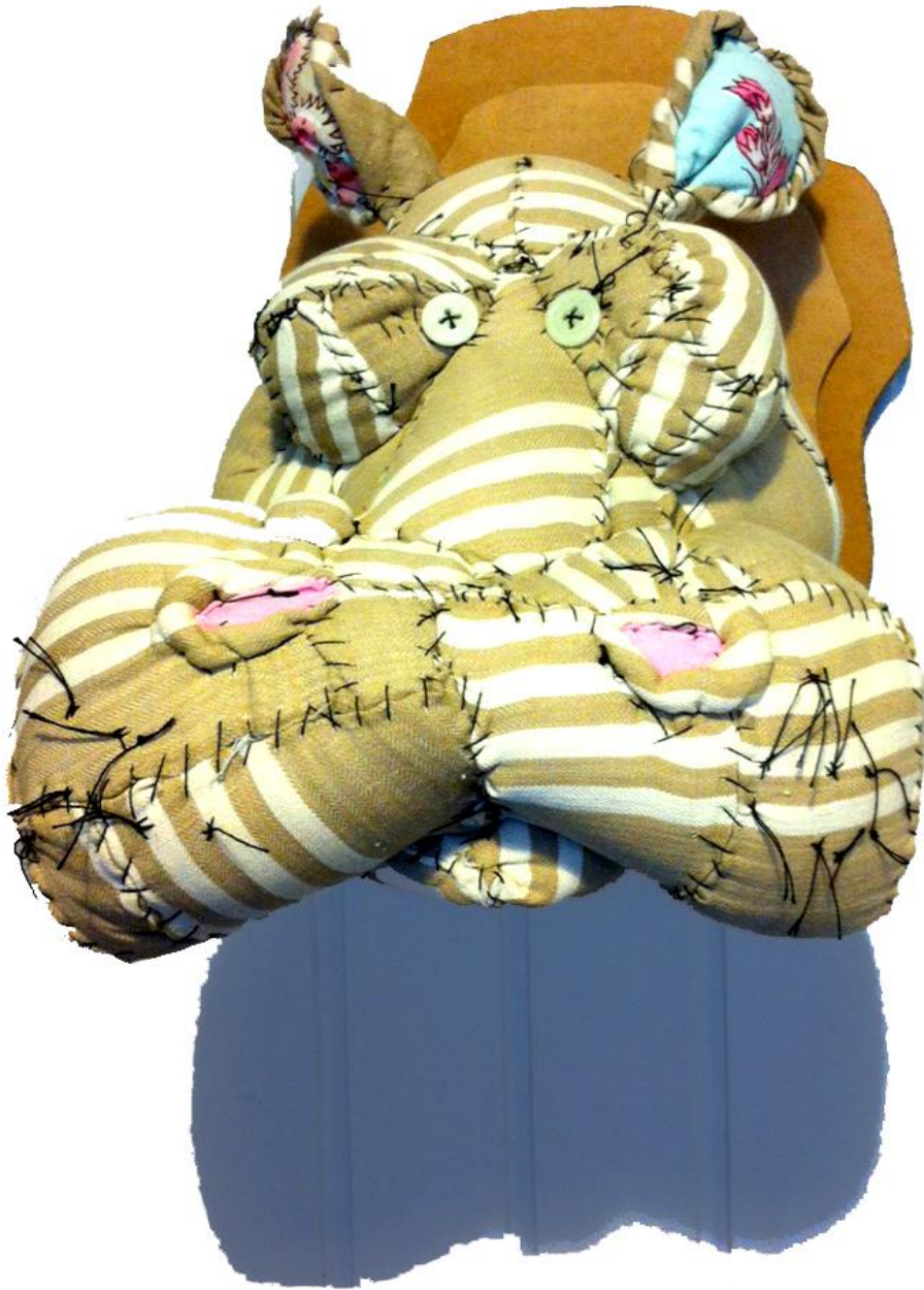
Harbin – Animal Trophy

Various fabrics, mattress, sheets, wadding, cardboard, buttons & trimming Approx 20" x 20" x 10" / 50 x 50 x 25 cm