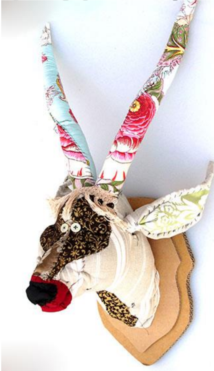
Maisy – Fabric Sculpture

Various fabrics, mattress, sheets, wadding, cardboard, buttons & trimming Approx 20" x 20" x 10" / 50 x 50 x 25 cm