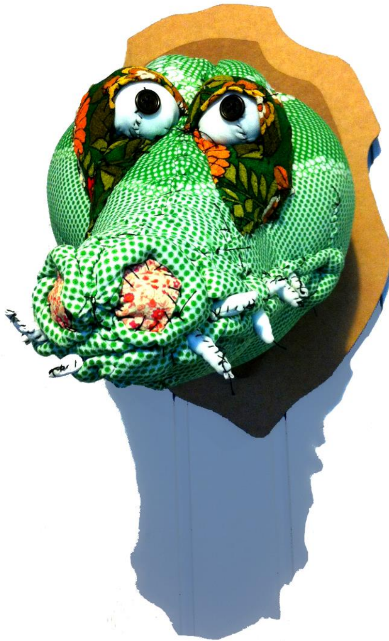
Louis the Alligator – Animal Trophy

Various fabrics, mattress, sheets, wadding, cardboard, buttons & trimming Approx 20" x 20" x 10" / 50 x 50 x 25 cm