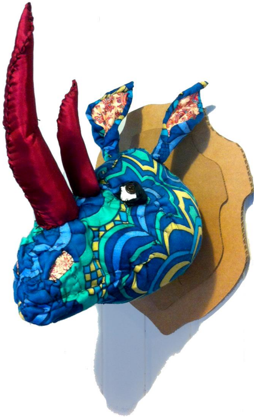
Ramond – Animal Trophy

Various fabrics, mattress, sheets, wadding, cardboard, buttons & trimming Approx 20" x 20" x 10" / 50 x 50 x 25 cm