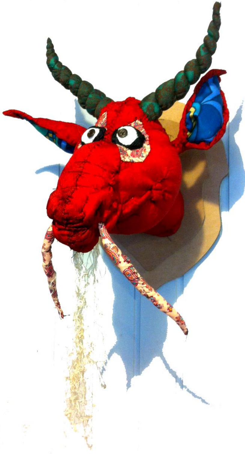
Russell – Animal Trophy

Various fabrics, mattress, sheets, wadding, cardboard, buttons & trimming Approx 20" x 20" x 10" / 50 x 50 x 25 cm