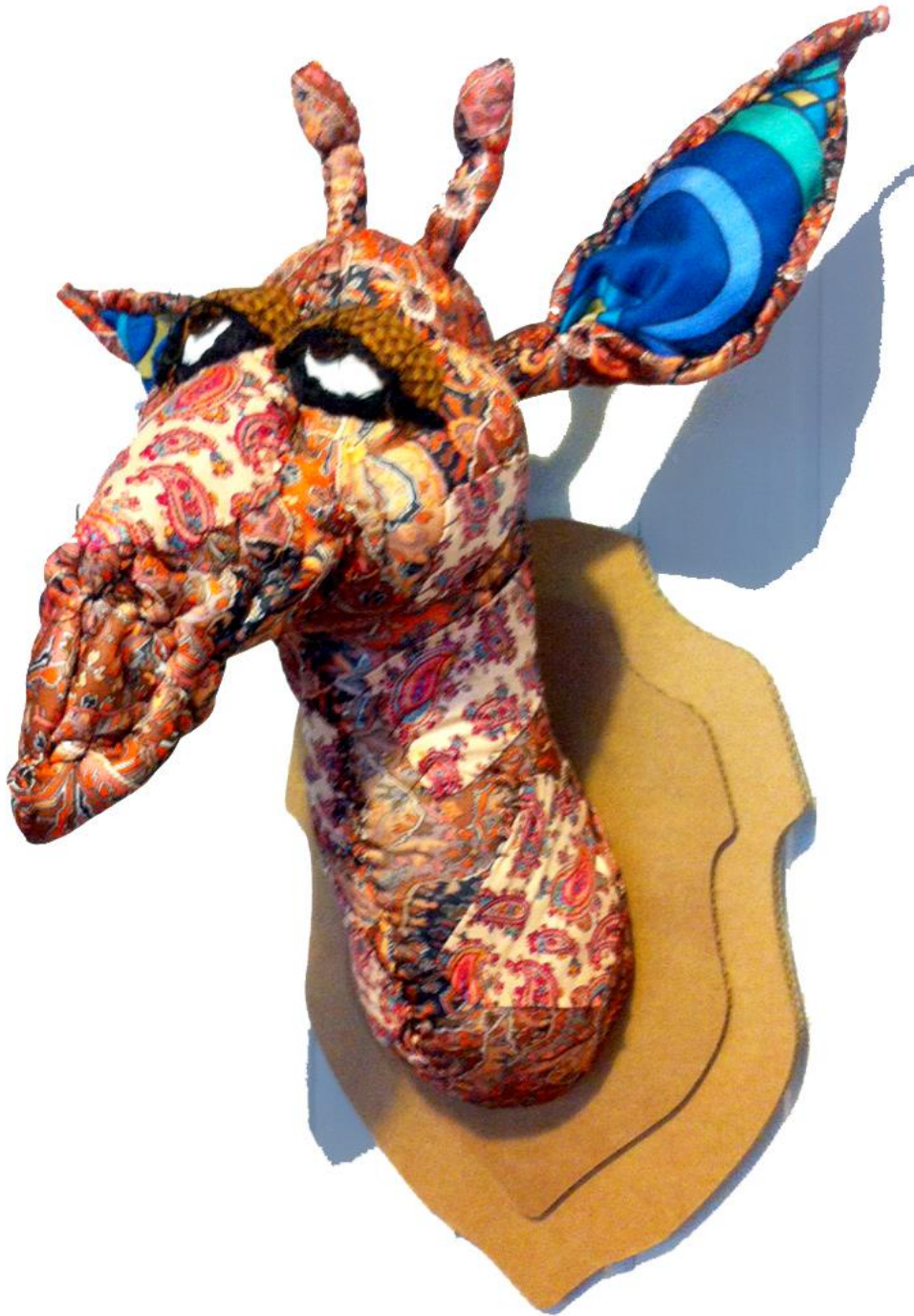
Gabrielle – Animal Trophy

Various fabrics, mattress, sheets, wadding, cardboard, buttons & trimming Approx 20" x 20" x 10" / 50 x 50 x 25 cm