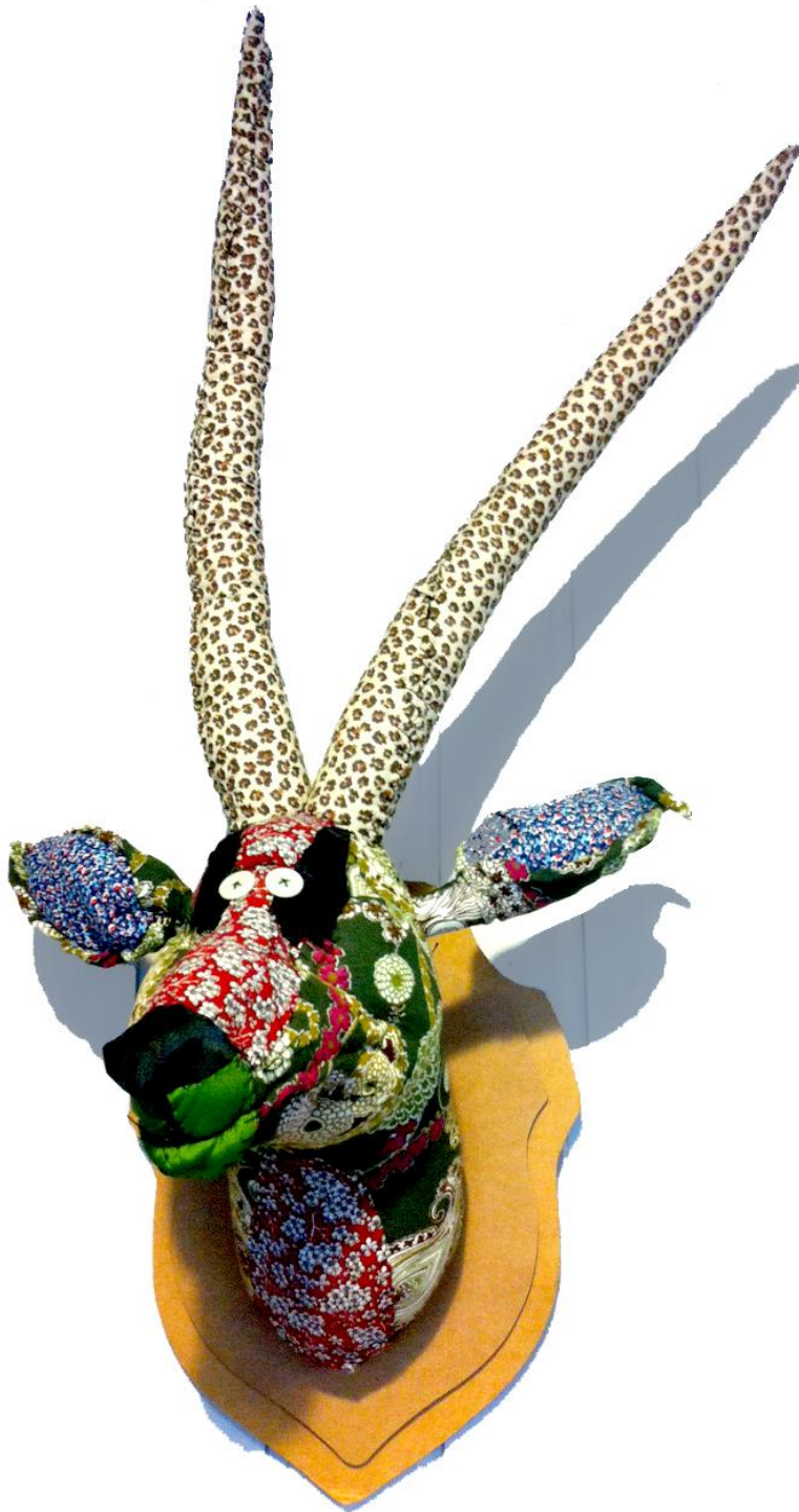
Isidore – Animal Trophy

Various fabrics, mattress, sheets, wadding, cardboard, buttons & trimming Approx 20" x 20" x 10" / 50 x 50 x 25 cm