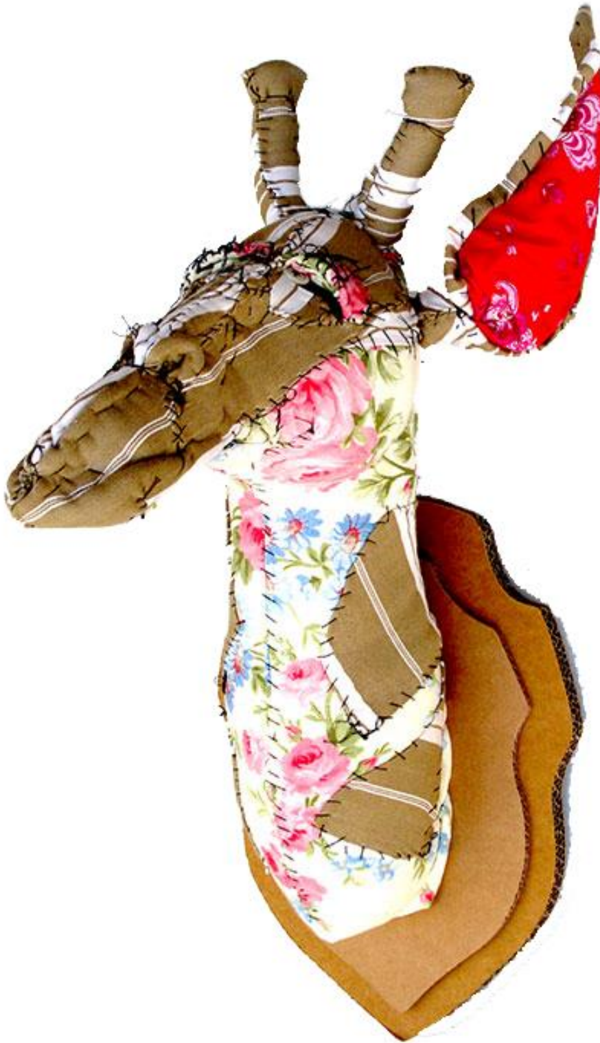
Gemma Giraffe – Fabric Sculpture

Various fabrics, mattress, sheets, wadding, cardboard, buttons & trimming Approx 20" x 20" x 10" / 50 x 50 x 25 cm