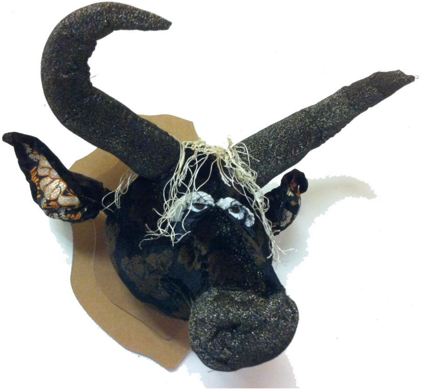
Guillaume – Animal Trophy

Various fabrics, mattress, sheets, wadding, cardboard, buttons & trimming Approx 20" x 20" x 10" / 50 x 50 x 25 cm