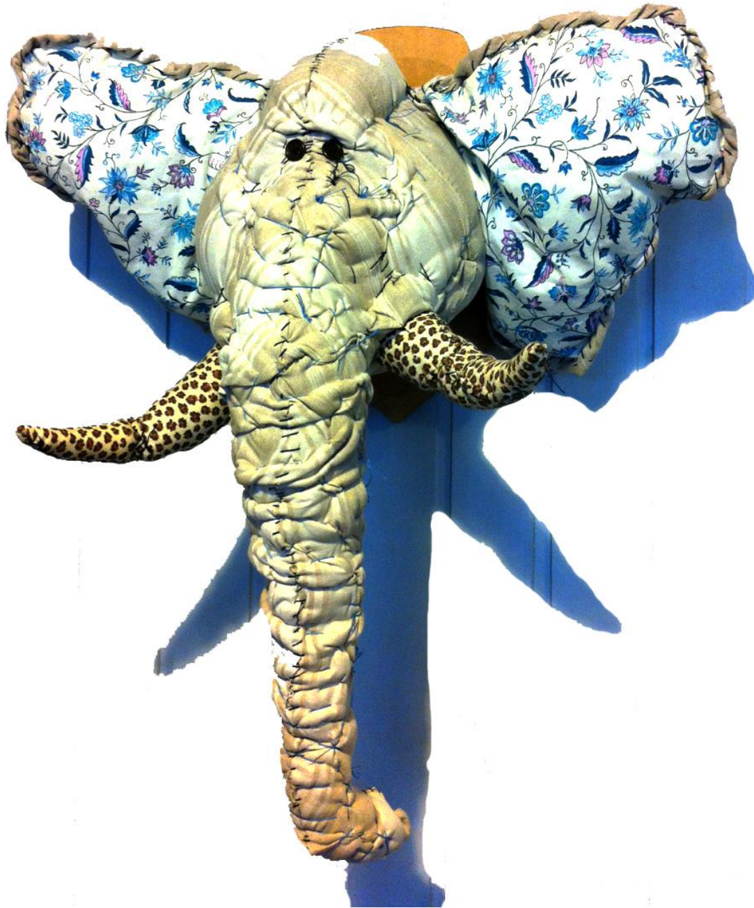
Zimba – Animal Trophy

Various fabrics, mattress, sheets, wadding, cardboard, buttons & trimming Approx 20" x 20" x 10" / 50 x 50 x 25 cm