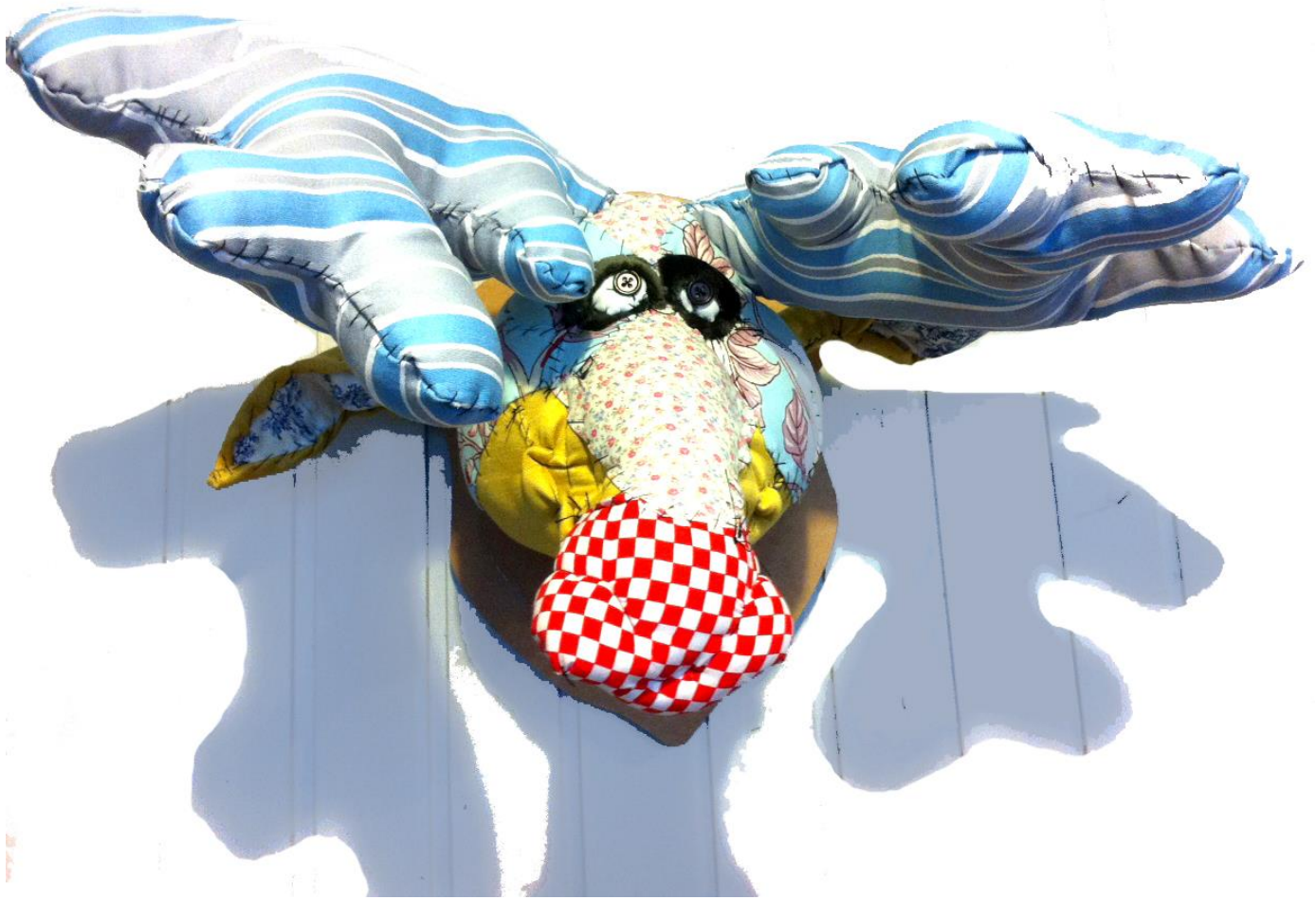
Ranger – Animal Trophy

Various fabrics, mattress, sheets, wadding, cardboard, buttons & trimming Approx 20" x 20" x 10" / 50 x 50 x 25 cm