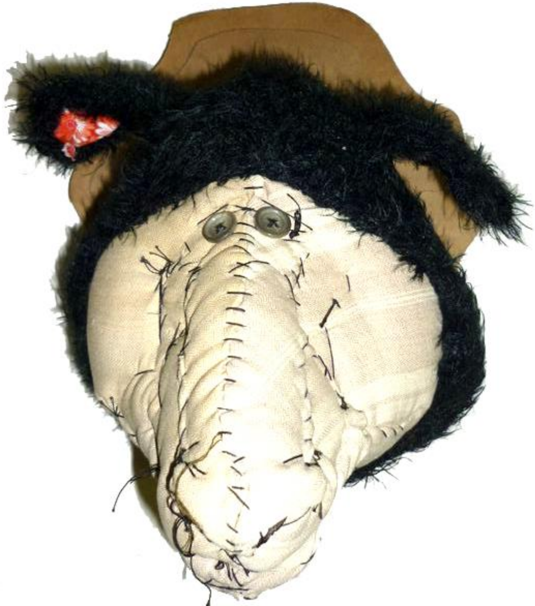
Mounton – Fabric Sculpture

Various fabrics, mattress, sheets, wadding, cardboard, buttons & trimming Approx 20" x 20" x 10" / 50 x 50 x 25 cm