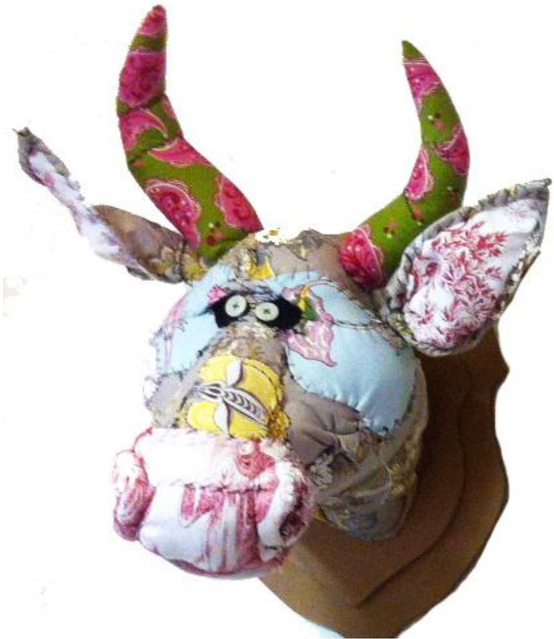
Mabelle – Animal Trophy

Various fabrics, mattress, sheets, wadding, cardboard, buttons & trimming Approx 20" x 20" x 10" / 50 x 50 x 25 cm