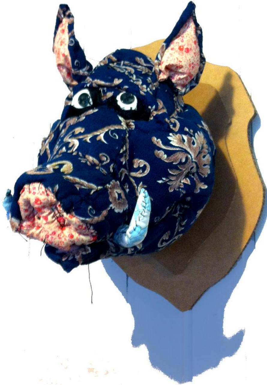
Wild, the Boar – Animal Trophy

Various fabrics, mattress, sheets, wadding, cardboard, buttons & trimming Approx 20" x 20" x 10" / 50 x 50 x 25 cm