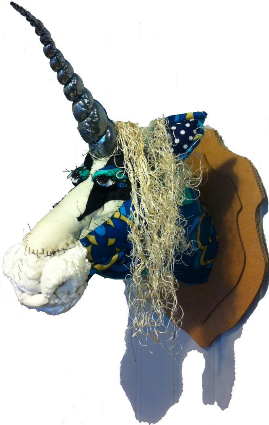
Carressa – Animal Trophy

Various fabrics, mattress, sheets, wadding, cardboard, buttons & trimming Approx 20" x 20" x 10" / 50 x 50 x 25 cm