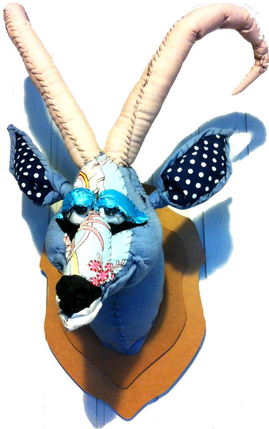
Tilda – Animal Trophy

Various fabrics, mattress, sheets, wadding, cardboard, buttons & trimming Approx 20" x 20" x 10" / 50 x 50 x 25 cm