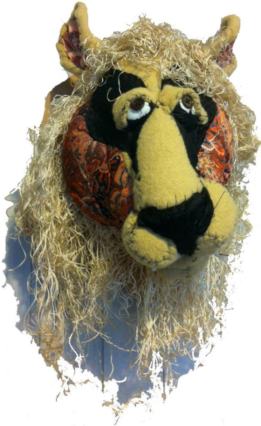
Cecil the Liger – Animal Trophy

Various fabrics, mattress, sheets, wadding, cardboard, buttons & trimming Approx 20" x 20" x 10" / 50 x 50 x 25 cm