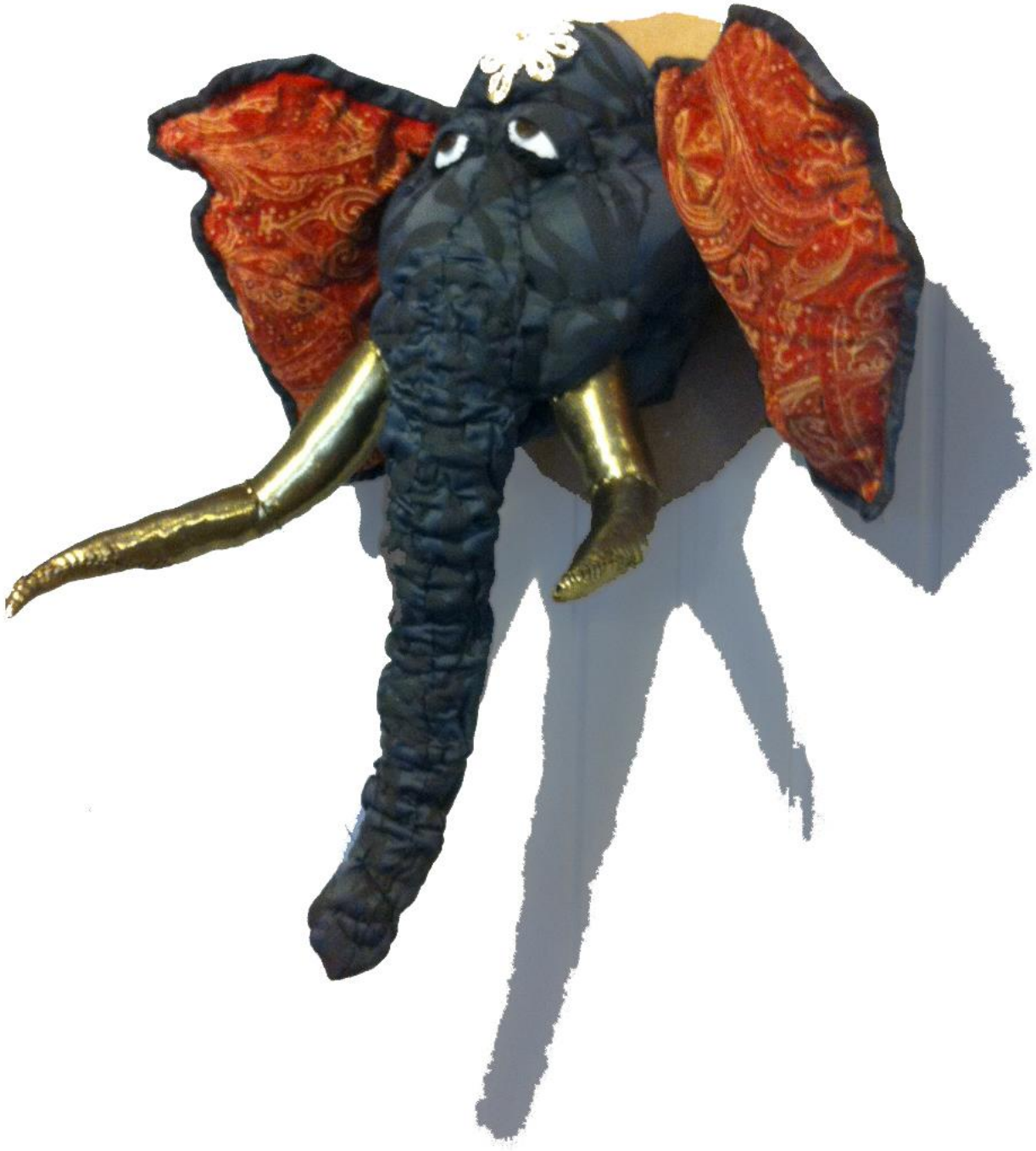
Darci – Animal Trophy

Various fabrics, mattress, sheets, wadding, cardboard, buttons & trimming Approx 20" x 20" x 10" / 50 x 50 x 25 cm