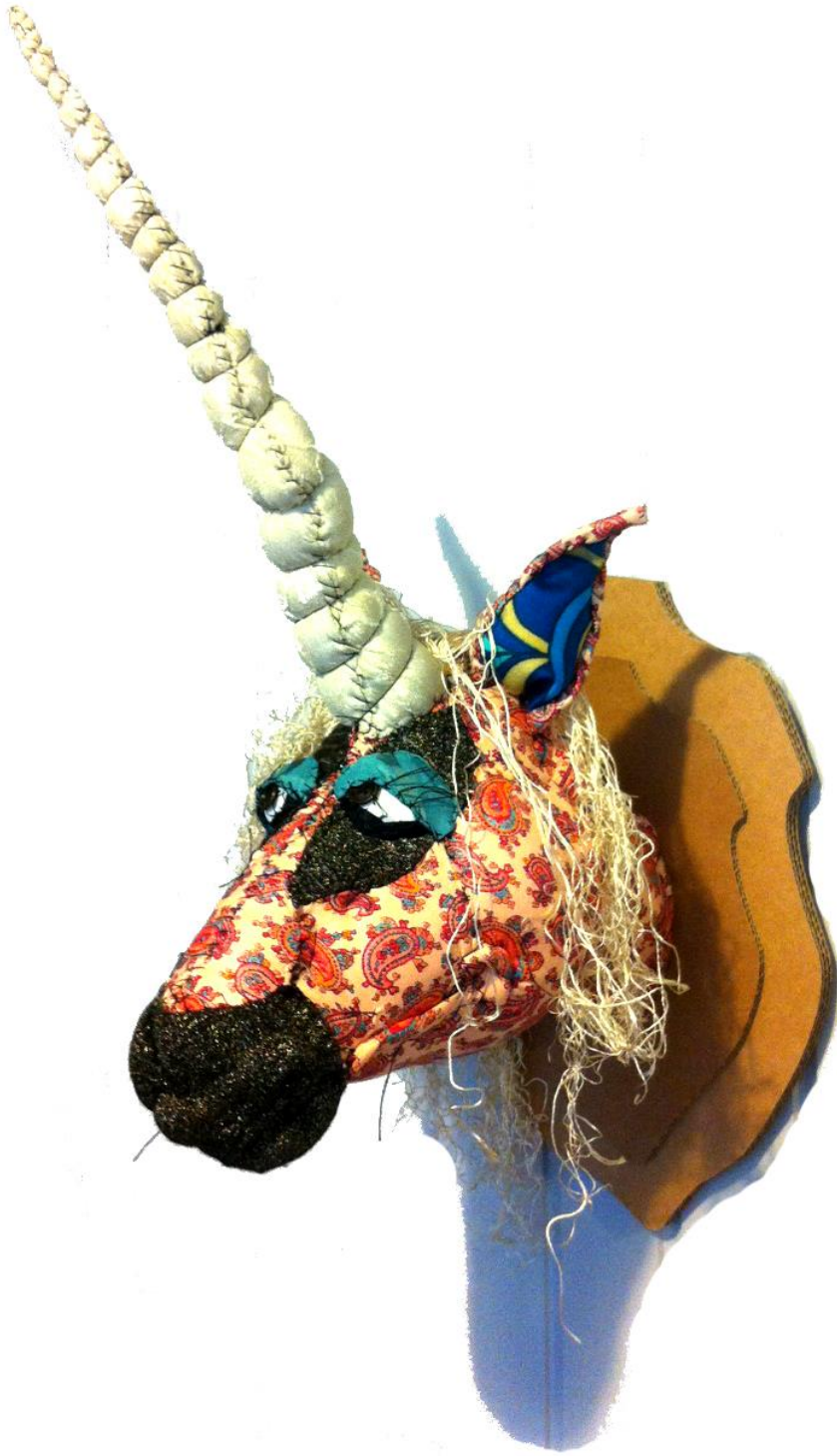
Candide – Animal Trophy

Various fabrics, mattress, sheets, wadding, cardboard, buttons & trimming Approx 20" x 20" x 10" / 50 x 50 x 25 cm