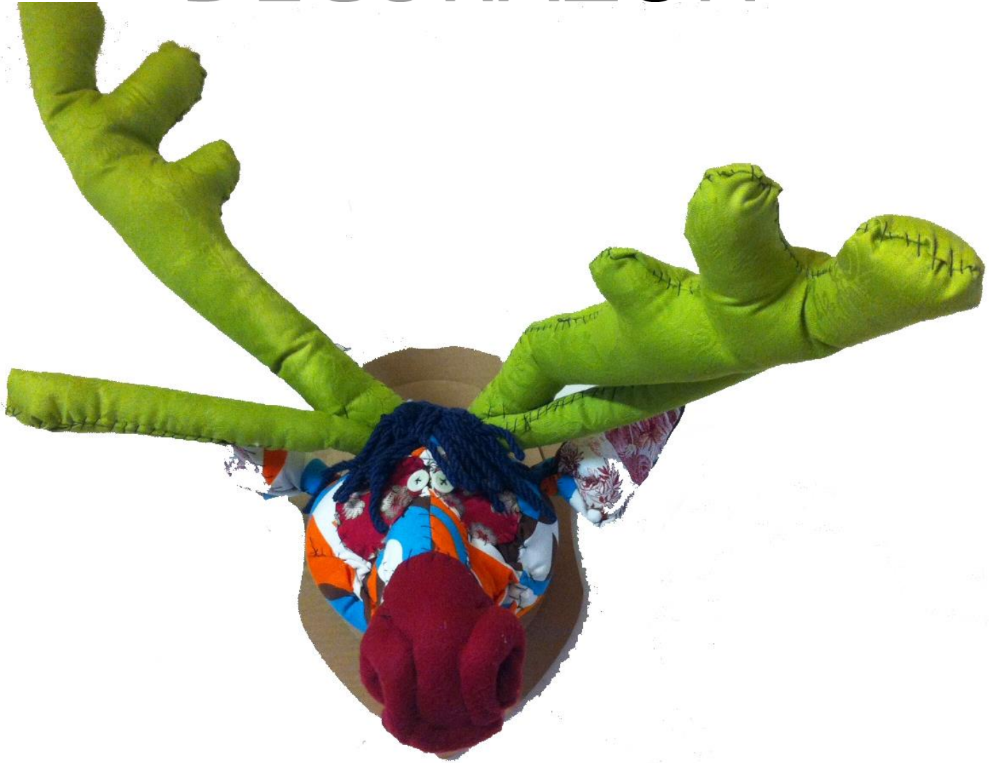
Camille Caribou – Animal Trophy

Various fabrics, mattress, sheets, wadding, cardboard, buttons & trimming