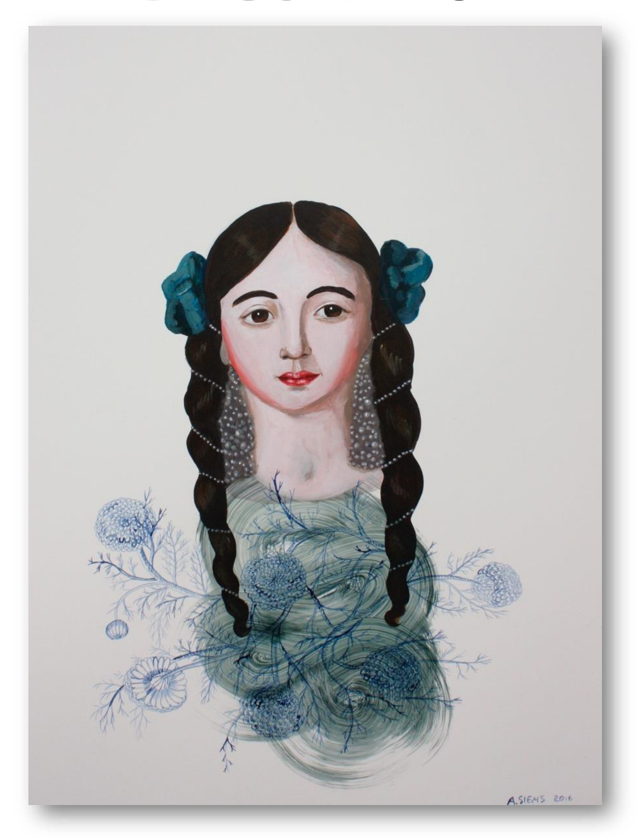
Face #5 Acrylic on white clay panel 24" x 18" inches / 61 x 46 cm