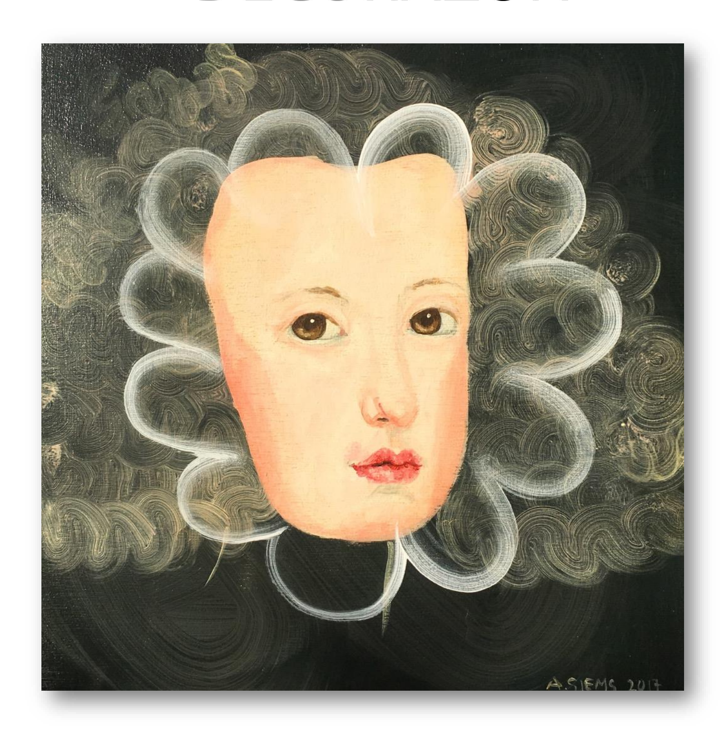
Acrylic on panel 12" x 12" inches / 30 x 30 cm