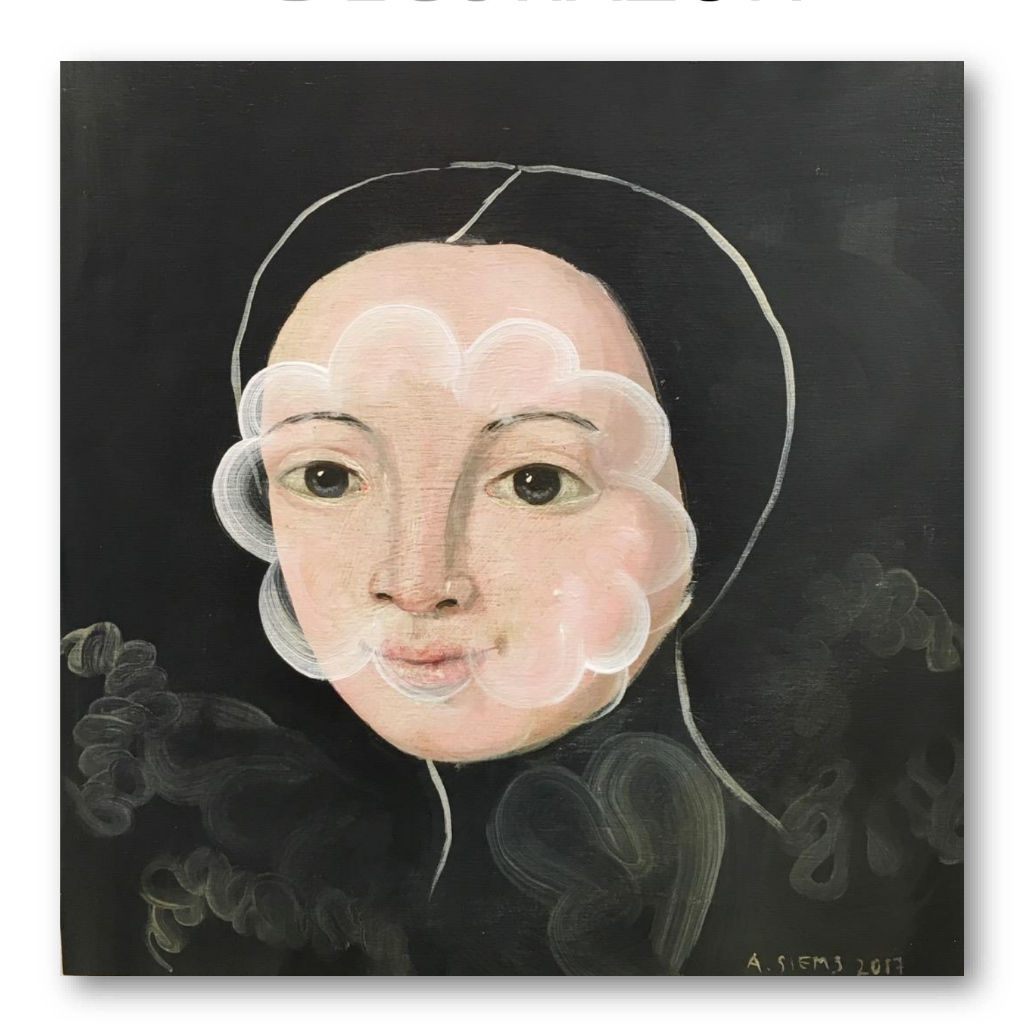
Bloom 3 Acrylic on panel 12" x 12" inches / 30 x 30 cm