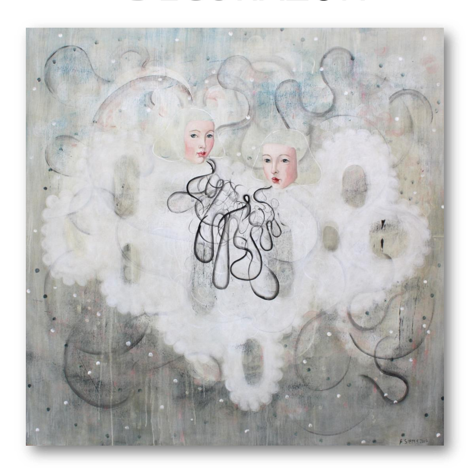
Language Acrylic on prepared wood panel 48" x 48" inches / 122 x 122 cm