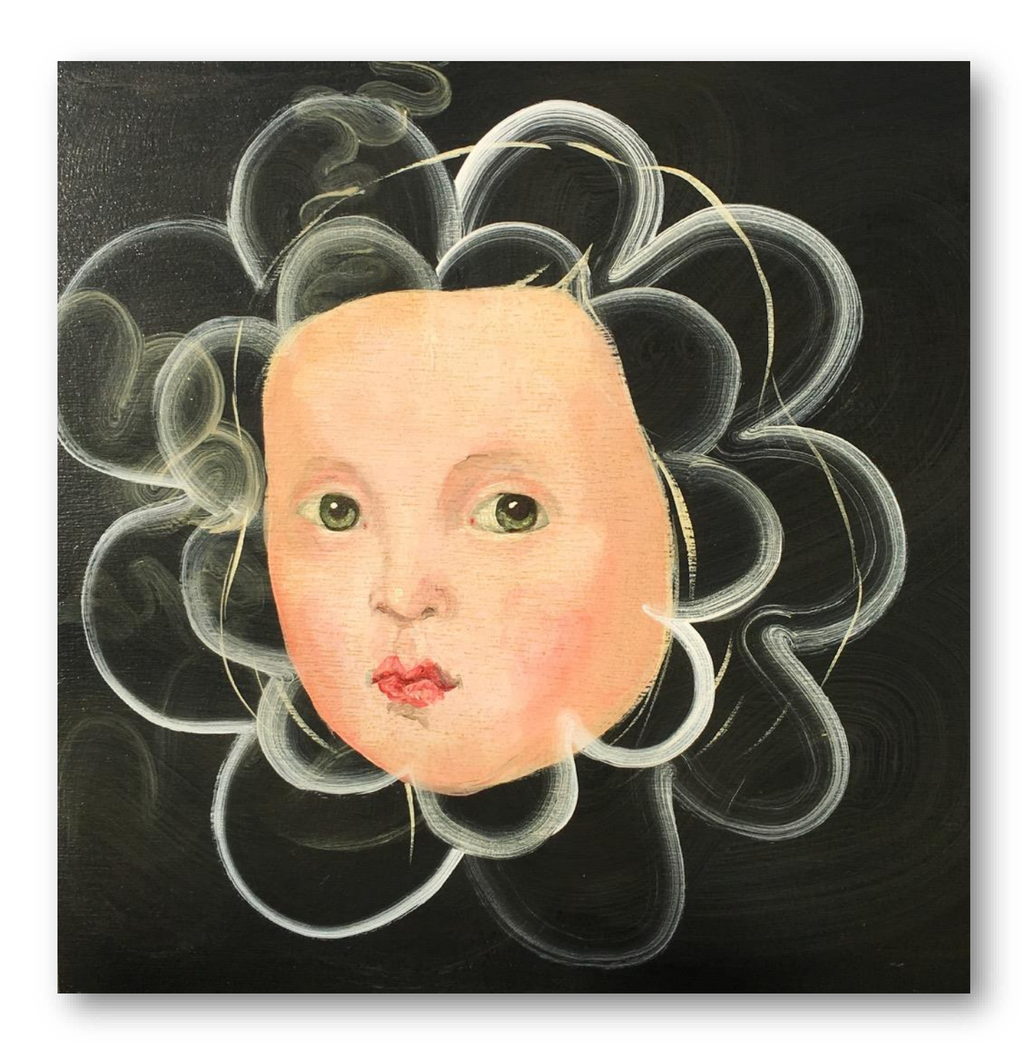
Bloom 1 Acrylic on panel 12" x 12" inches / 30 x 30 cm